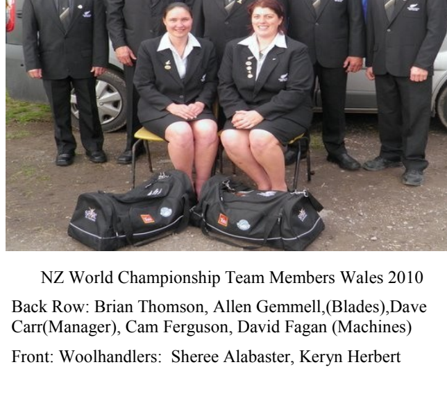
NZ World Championship Team Members Wales 2010